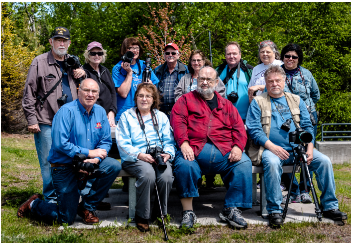
Black Bear and Waterfalls Trip Group shot